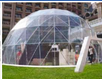
Transparent PVC Roof Cover