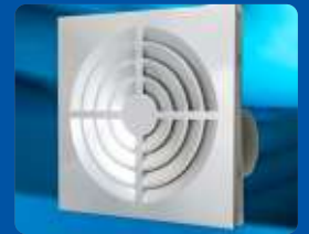
Silent Exhaust Fan