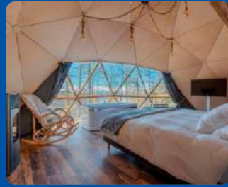
PU Leather Insulation