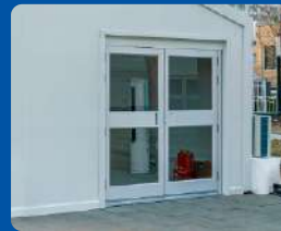
Double Glass Door