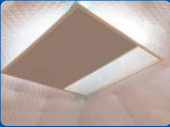
Auto Skylight Curtain