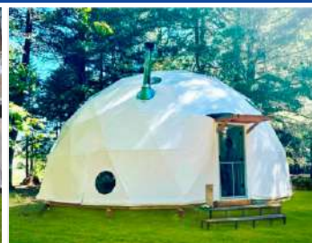
White, Opaque PVC Roof Cover