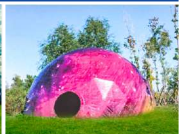
Custom advertising PVC Roof Cover