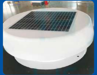
Solar Exhaust Fan