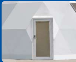
Single Glass Door