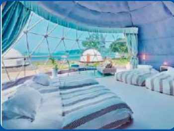
Single Rail Curtain