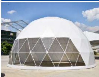
Transparent +White PVC, Opaque PVC Roof Cover