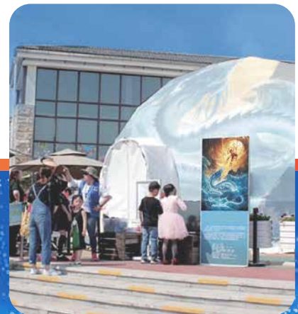
Theme Park Solutions