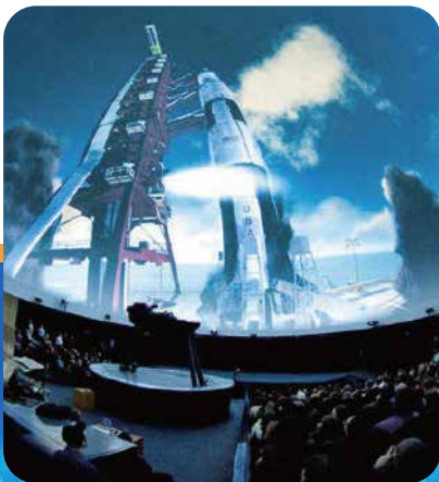
Popular science activities and educational domes